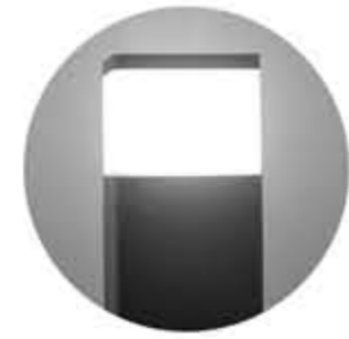
灯具尺寸 Product Dimensions(mm)