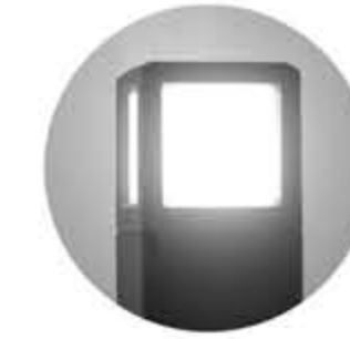
灯具尺寸 Product Dimensions(mm)